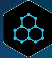
DUAL CARBON TECHNOLOGY

POUND FOR POUND, NOTHING ELSE COMES CLOSE.