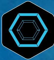
VARIABLE FACE THICKNESS