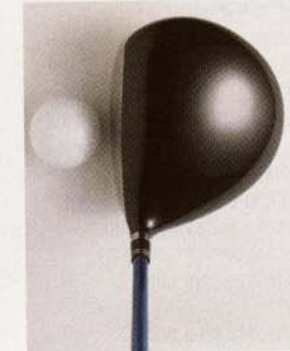
Tour Edge Exotics Proto