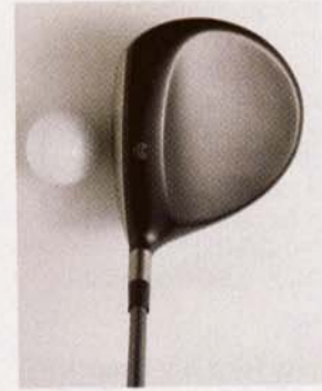
Cleveland HiBore XL Tour