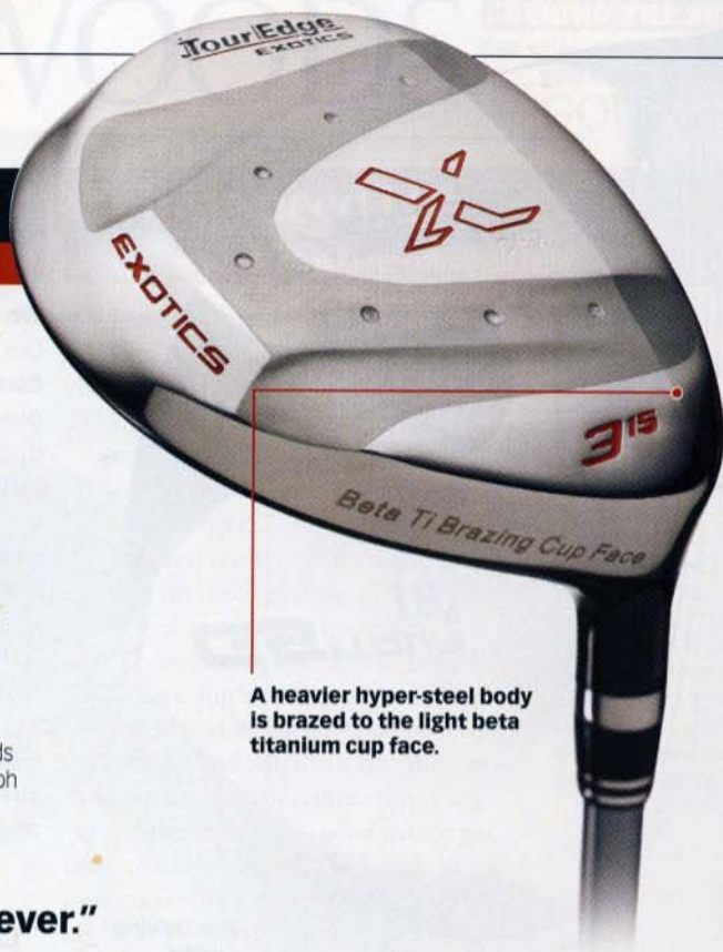
A heavier hyper-steel body is brazed to the light beta titanium cup face.

"Easy swing leads to sweet-feeling, sweet-flying shots that seem to go forever."